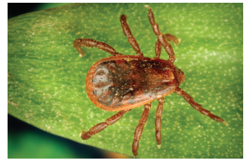
Brown Dog Tick