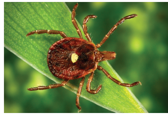
Lone Star Tick