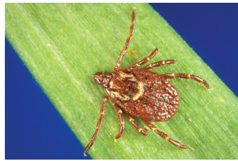
American Dog Tick